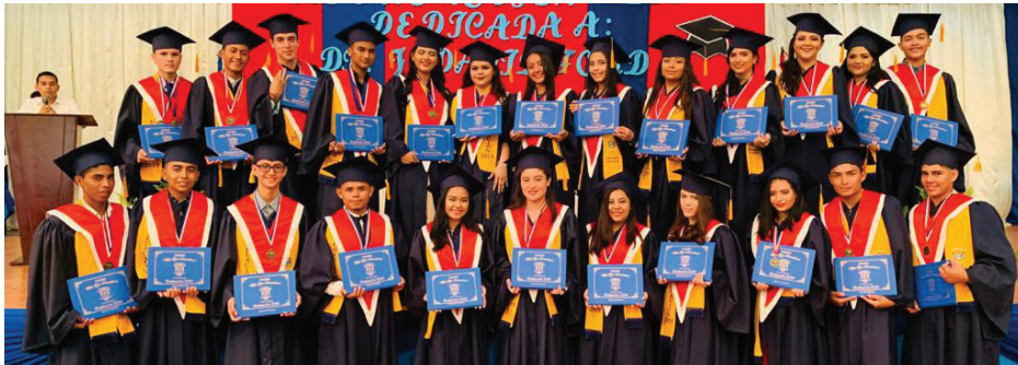
Senior Graduating Class of 2019

We do need your continued "Prayer of Agreement" for the $4,100 that is due our teachers, that we do not have. None of the $4,100 has been given. LET'S KEEP BELIEVING!!! STAND BY FOR A VICTORY REPORT!!!