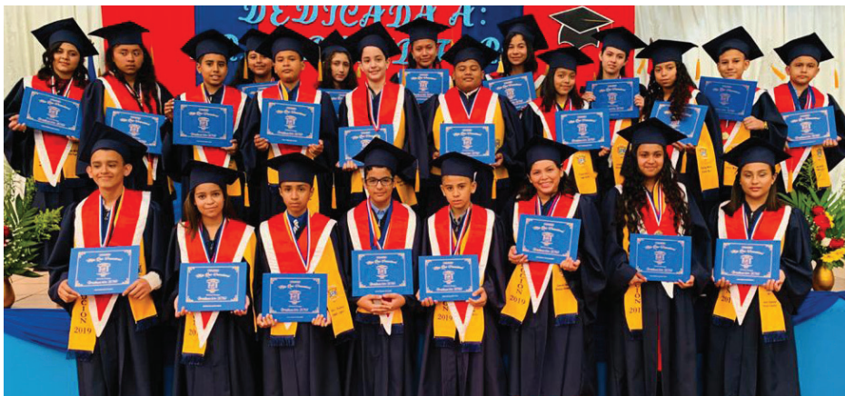
Sixth Grade Graduating Class of 2019